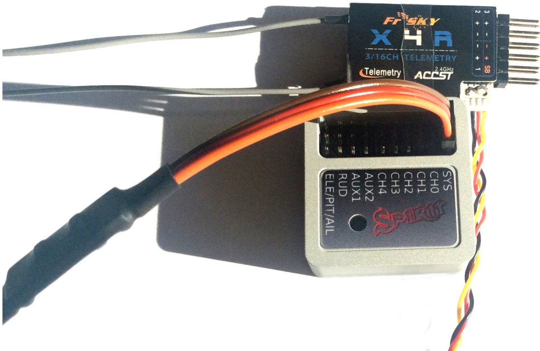
Example 1: connection scheme for the Integration part with X4R-SB receiver